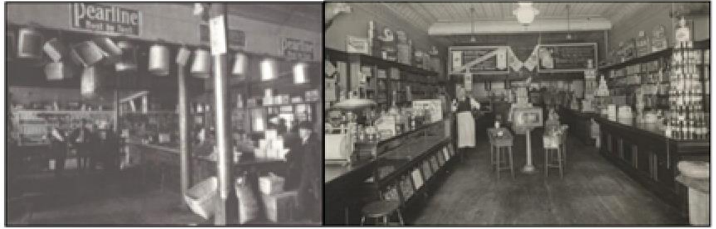
Museum image (Documentary Artifact): 1915 inside Geo. Vick & Sons Store, Orillia