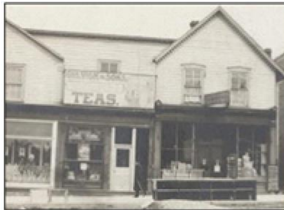
Museum image 1911 photo of Geo. Vick & Sons Store and order/invoice form

The roller mill produced flour and grain: straight grade flour, oatmeal, cornmeal, cracked wheat, graham flour, buckwheat flour. In 1911 brands of Lilly were made from spring wheat. The Eclipse brand was made from winter wheat. In 1897 the mill produced up to 500 bushels per hour. The business closed during the 1930s before Canada entered the Second World War. Today the Geo. Vick store is the home of the Mariposa Market. When it was Geo. Vick Store & Bakery, the